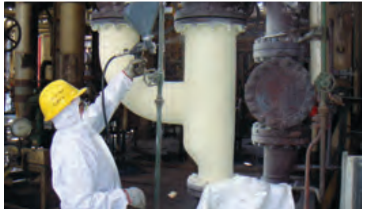
Phase of HPC® Coating application