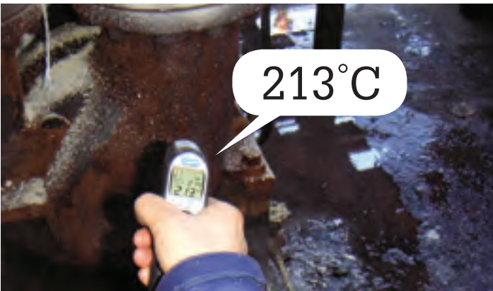
Temperature on the pipe before HPC® Coating was 213°C (415.4°F)