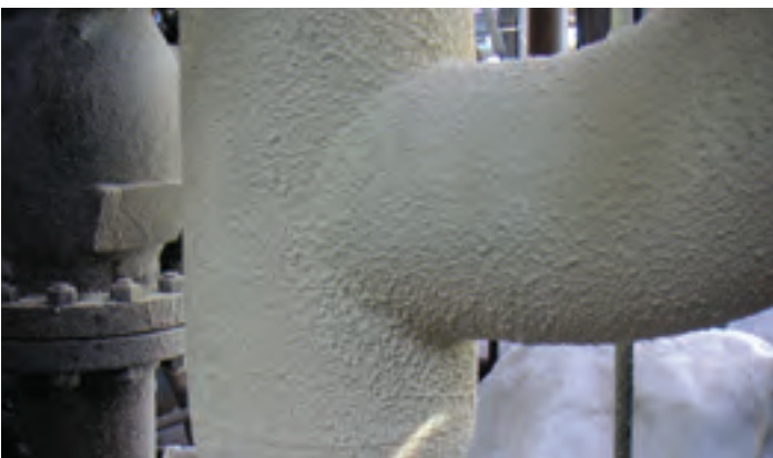
Finished HPC® Coating application