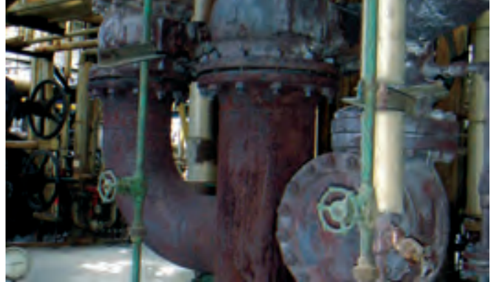
Pipe system before HPC® Coating application, showing extensive CUI