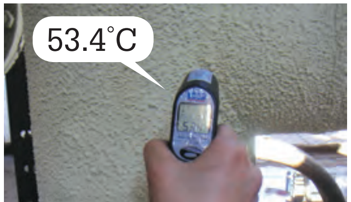
Temperature after HPC® Coating application was 53.4°C (128.12°F)