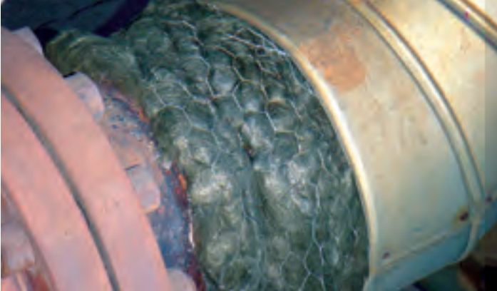
Exposed traditional wrap and cladding insulation