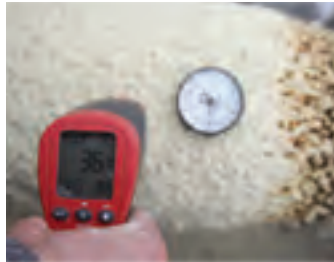
After HPC® Coating application 96.8°F (36°C)