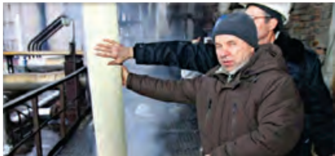
This pipe surface was 865.4°F (463°C) before coating. These men were able to touch the pipe after only 25mm (1") of HPC® Coating was applied. Additional coating thickness was added to complete the project for long-term performance and durability.