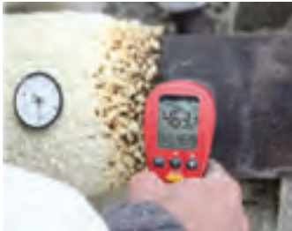
Before HPC® Coating application 865.4°F (463°C)