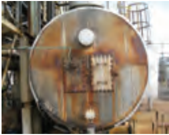
Incinerator before HPC® Coating application was 356°F (180°C).